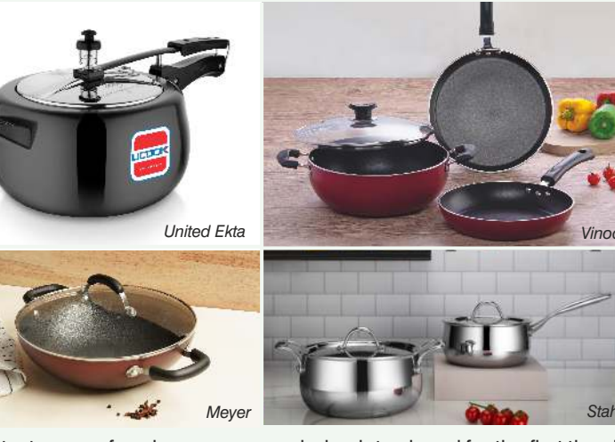
their latest range of cookware.

Several leading brands like Hawkins, Vinod Cookware, Meyer, United Ekta, Stahl, Maharaja, OK, Bhalaria, Roxx, FNS, Macclite, Cello, Dailyware, Roca, Black Diamond, Classic Essentials will showcase